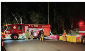
Picture of Engine 1 drafting from 3000-gallon water Tender 1 during a non-hydrant training scenario.

A little about us: The OFD is currently licensed by the State of Wisconsin as an EMT-B non-transport agency. As we strive to provide the highest level of services to our customers we continually work to upgrade our equipment to the benefit of those we serve. Recently, the OFD has upgraded our AEDs to Zoll cardiac monitors/defibrillators, consistent with those used by Tri-State ambulance. We are also eagerly awaiting the delivery of two new Lucas CPR assist devices. In addition to these important devices, the OFD also carries advanced-level EMT medications to administer consistent with our licensing. To learn even more please visit www.cityofonalaska.com/fire